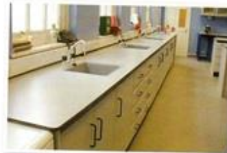
The New Lab Funded with Help From Crofton Rotary