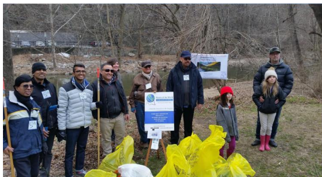
WWD 2018 at the Patapsco River Bank (same spot as WWD 2019)