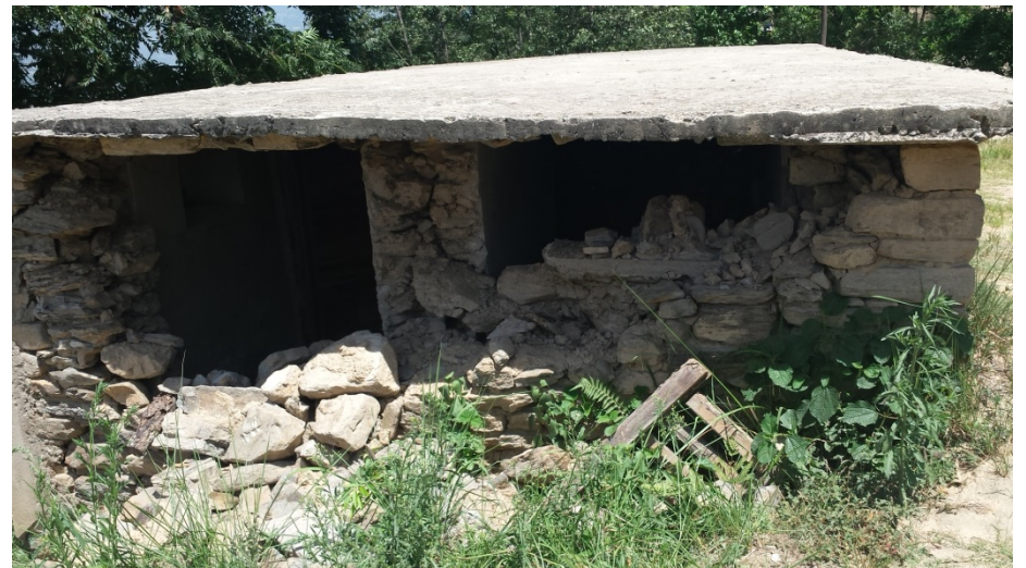
Crushed School Toilet (Thansing village)