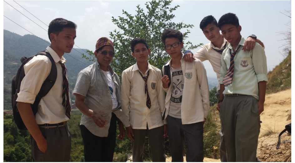
A young group of High School Students visiting the temple