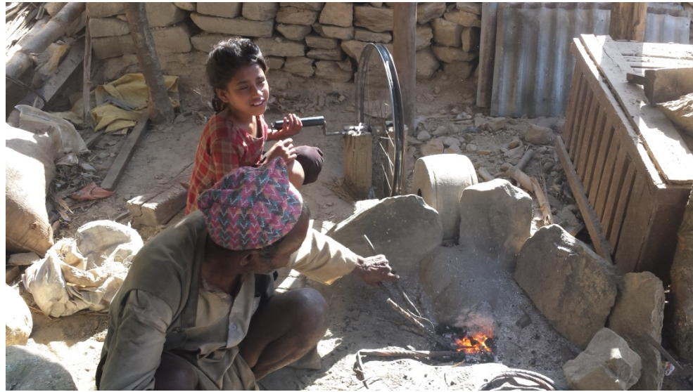
Local blacksmith – Given clothes