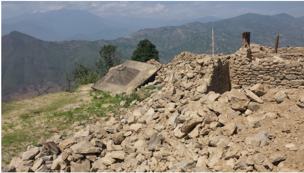
School Temple completely crushed

Rashtriya Secondary School, Thansing, Nuwakot.