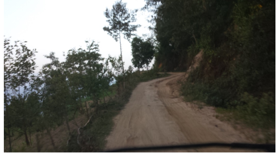
7 Kms of rough roads to reach the Village and School