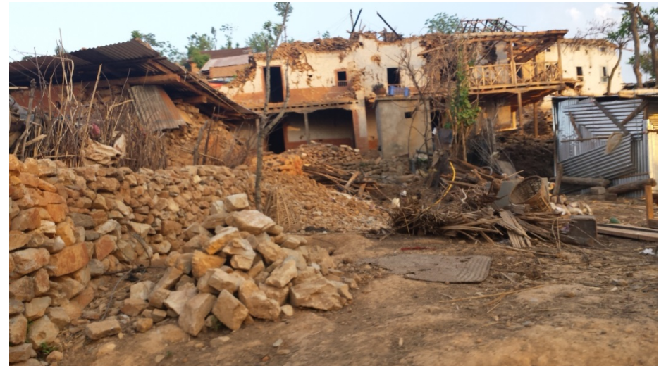
This village (Adhabaat) was one of the worst hit. One person died in the two-story building above. We provided some cash help to the family