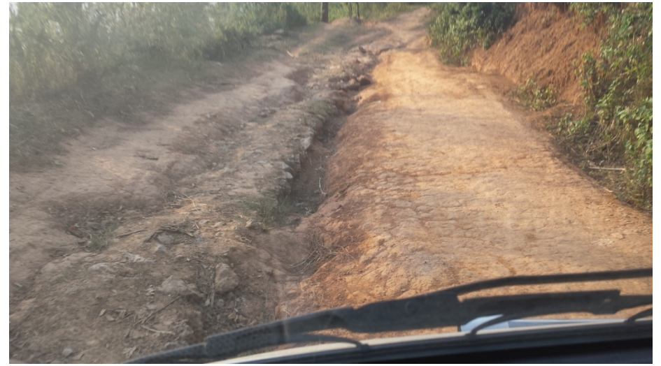
Typical village road condition traveled by us – Thanks to a ver Skillful Driver Krishna Sreshtha (seen/listed in a picture earlier)