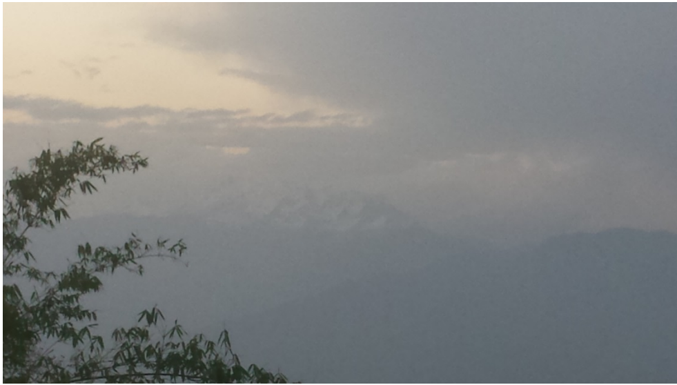
Snow capped Himalyan Peak (Lang Tang at distance)