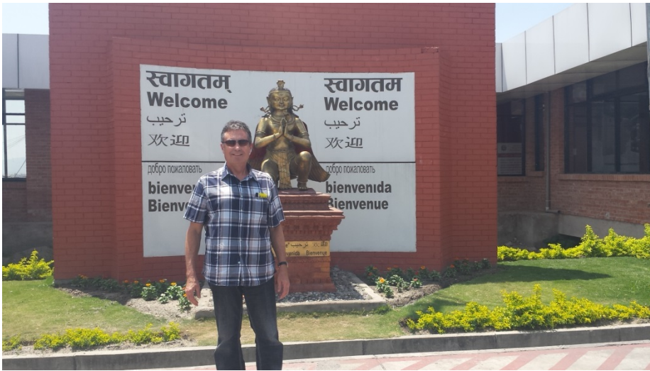
(Day 1 – May 30, 2015)