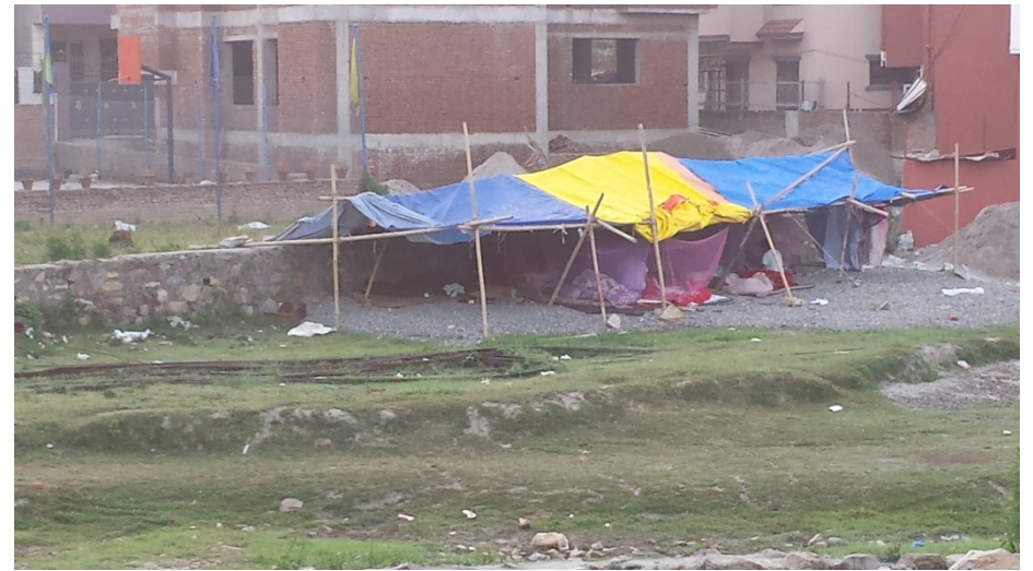
View through our window (next morning-People sleeping in tents)