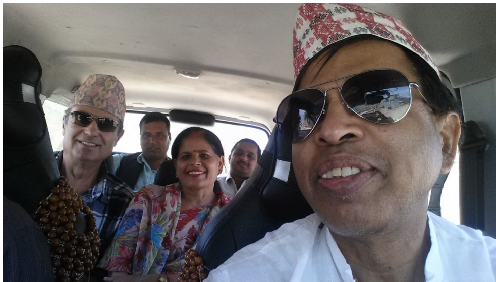
The traveling team to Thansing area..