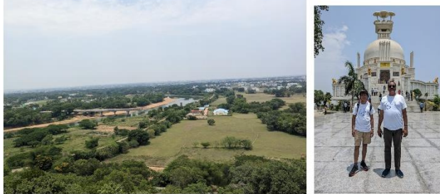
A few Pictures from Site Visits and Water Monitoring, April 28, 2023