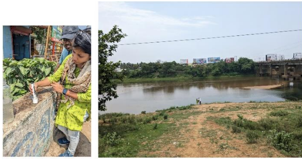
A few pictures from the site visits and field testing on April 28, 2023