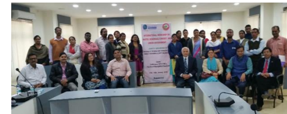
ROW/SOA Training Workshop on Water and Renewable Energy, 2018