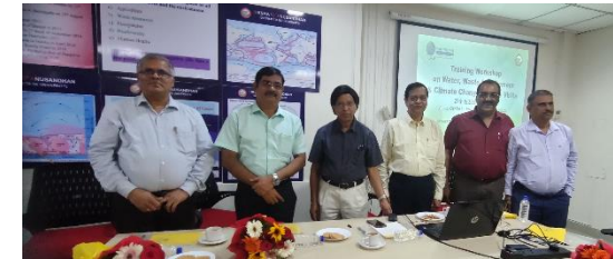
2023 Workshop Faculty on Climate and Water Issues, 2023