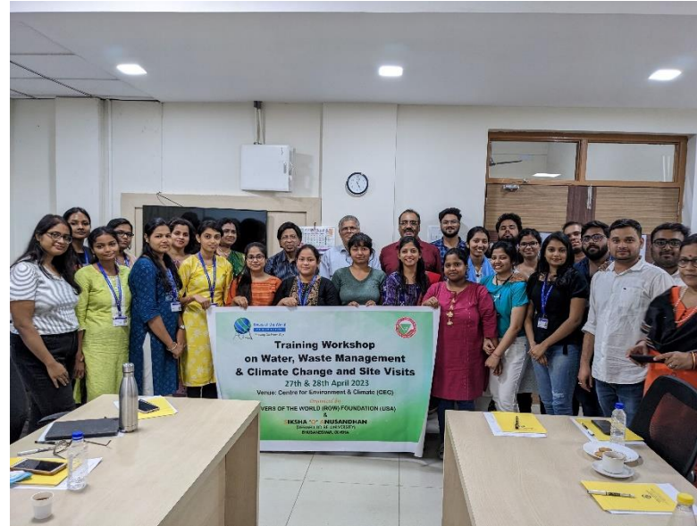
ROW/SOA Training Workshop on Climate Change Issues & Water, 2023