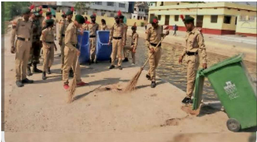
NCC cadets conducting cleanup