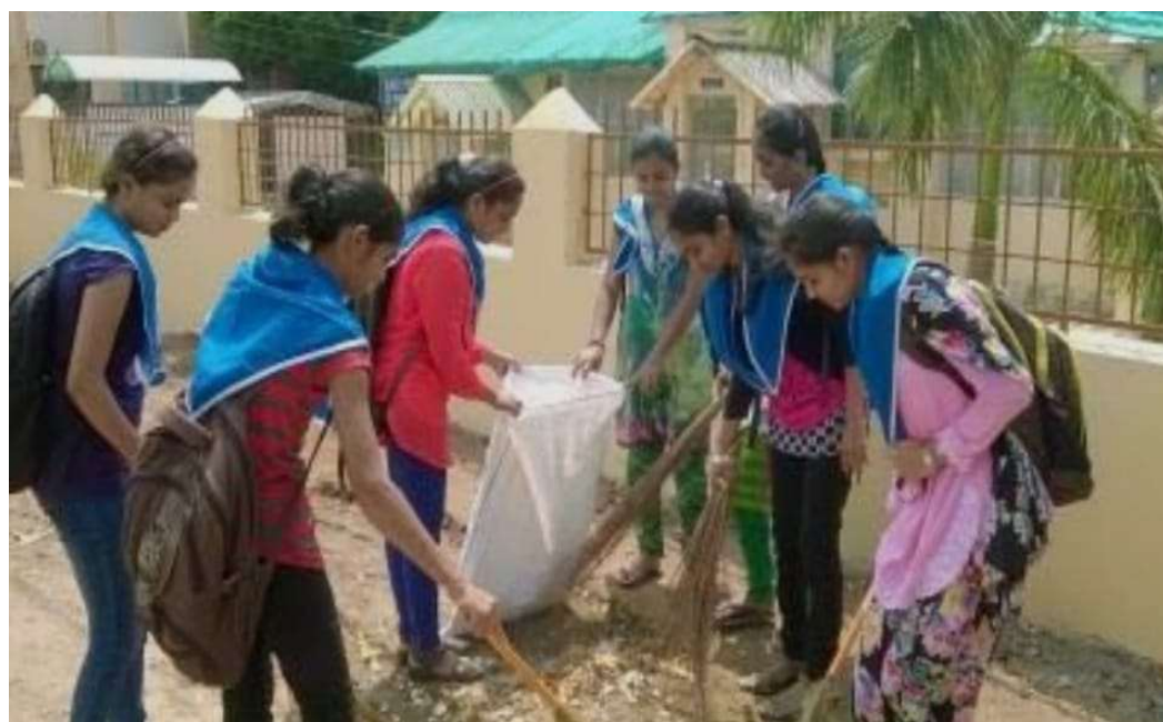
Visiting students participating in WWD 2025 cleaning up Gokul Yamuna