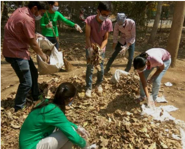
Visitors from other areas cleaning up trash

Pictures from the trash cleanup program.