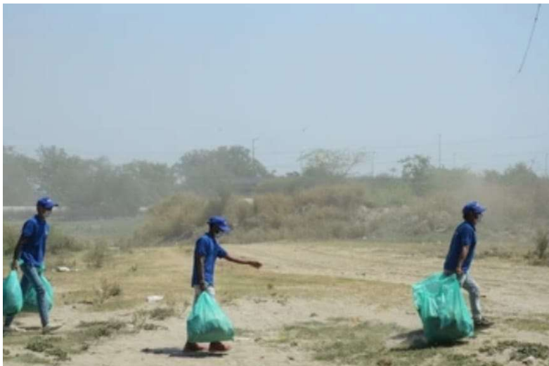
NGO from Agra collecting trash for Municipal trailers disposal to landfill