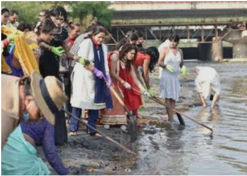
Visitors from other cities cleaning up trash

Pictures from the trash cleanup program.