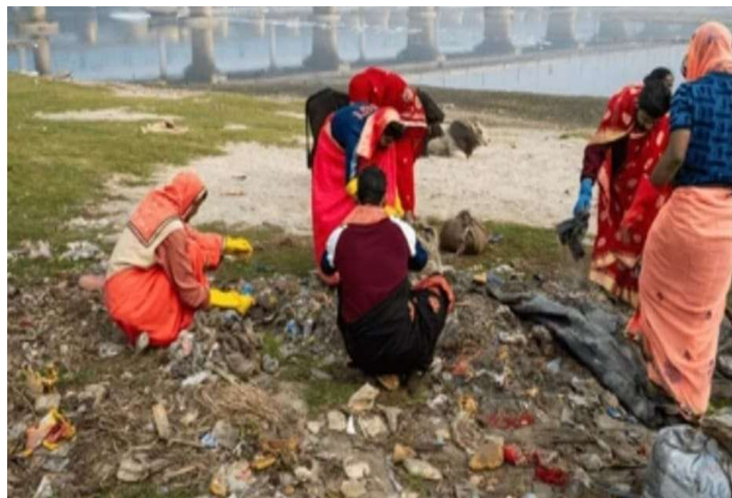
Visitors cleaning up trash