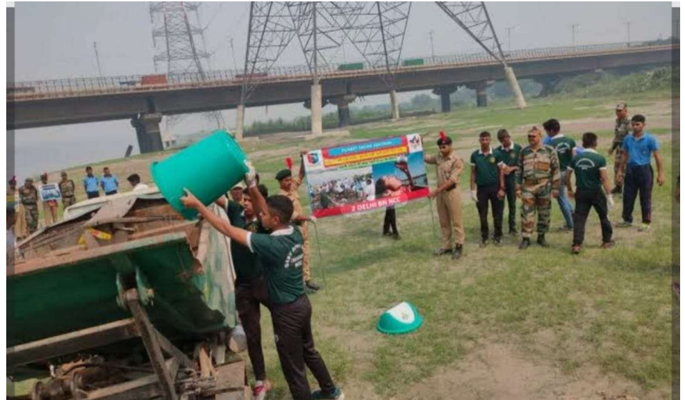
NCC cadets and local people conducting trash cleanup

Pictures from the trash cleanup program.