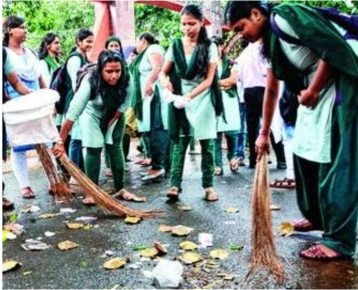
Visiting Global public school cleaning trash

Pictures from the trash cleanup program.