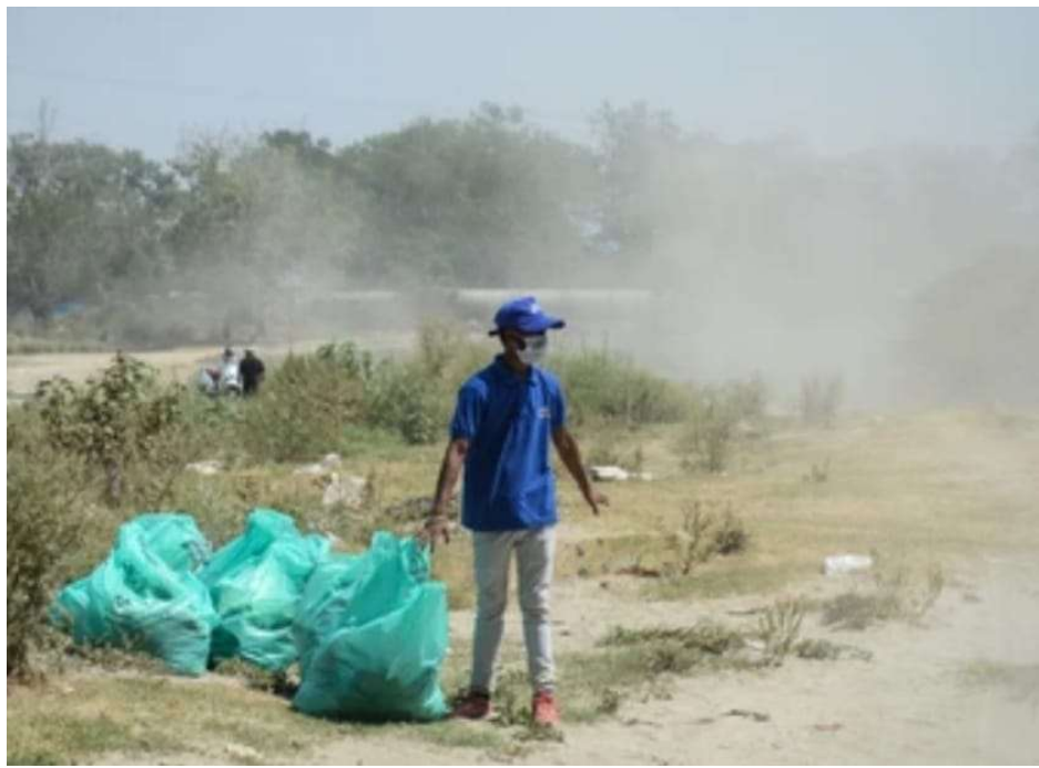
Local Municipal collectors cleaning up

Pictures from the trash cleanup program.