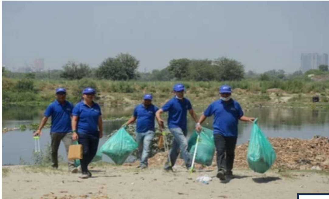
NGO from Agra collecting the trash at Yamuna bank

Pictures from the trash cleanup program.