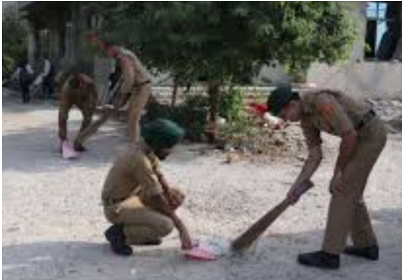
NCC cadets conducting cleanup

Pictures from the trash cleanup program.