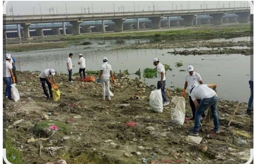
NGO from Noida cleaning the Yamuna bank

Pictures from the trash cleanup program.