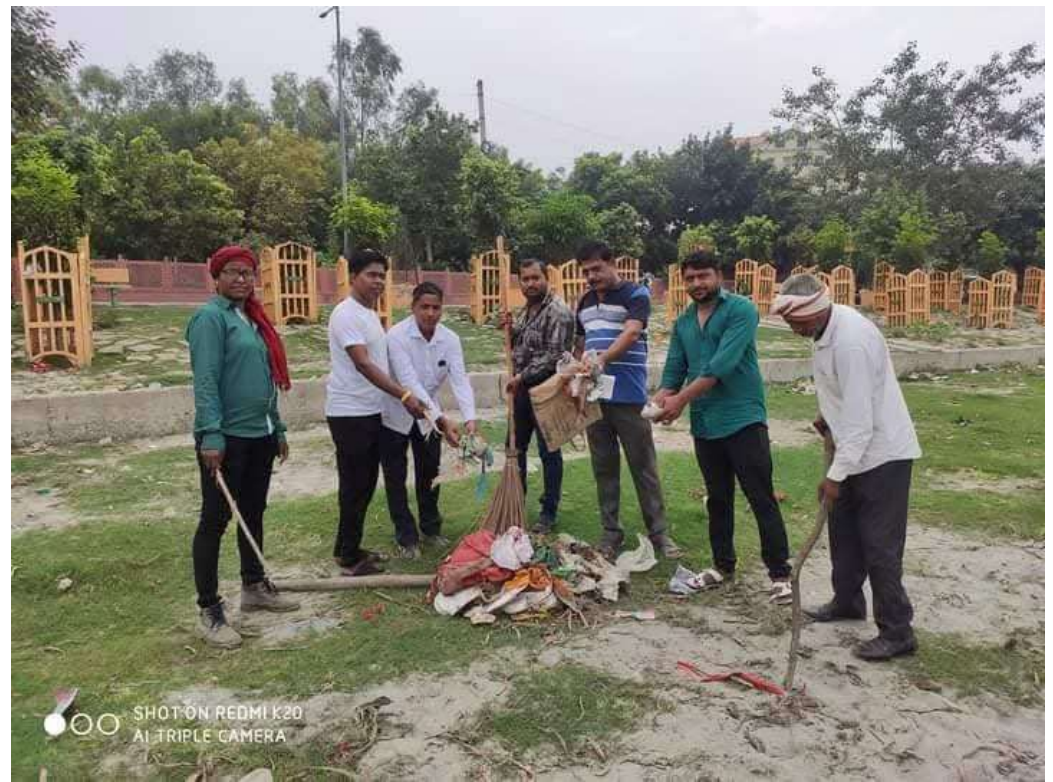
Visitors along with local people cleaning the Yamuna bank