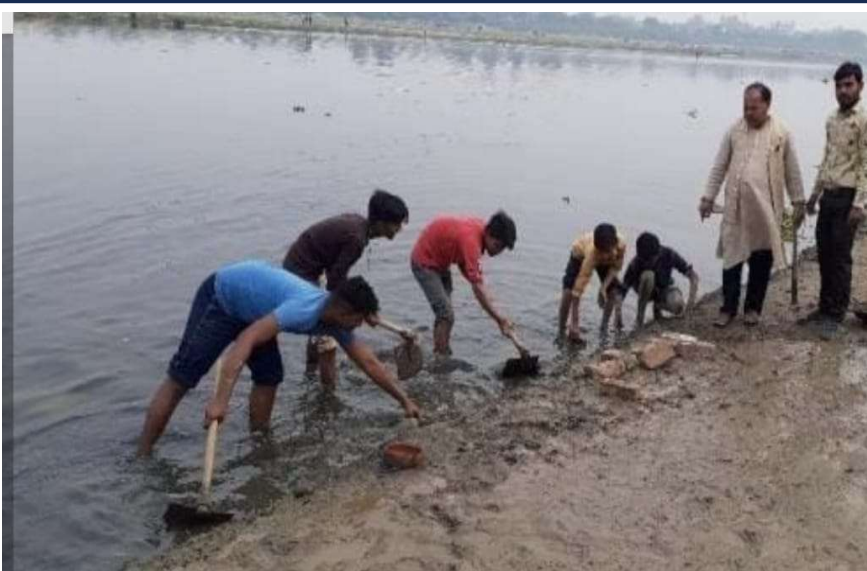
Visiting young people conducting Yamuna cleanup