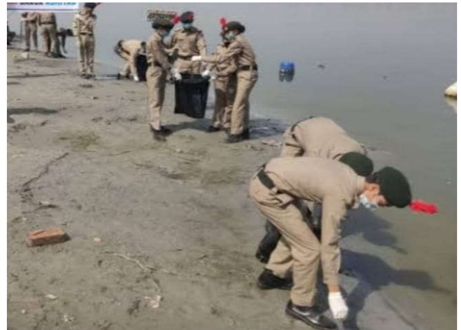
NCC cadets conducting cleanup