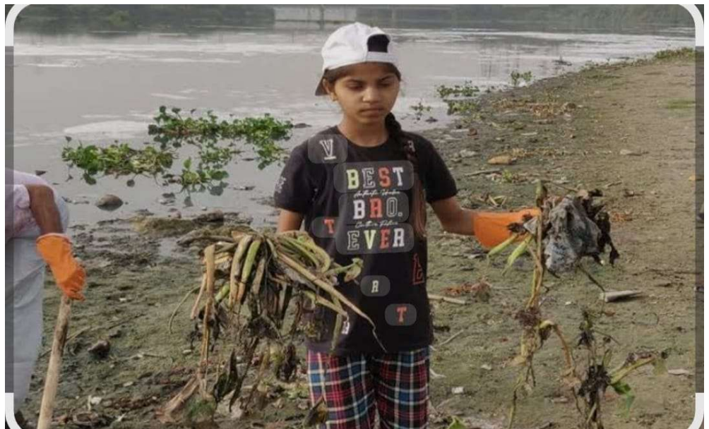
Little girl cleaning the Yamuna Bank

Pictures from the trash cleanup program.