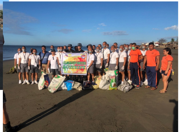
Participants from different National and local Agencies, Academe, City Councils and Barangay Residents.