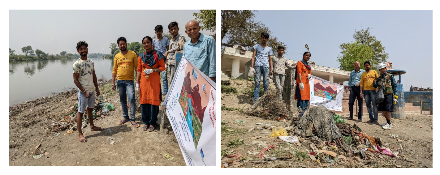
ROW volunteers collected old clothes and other trash dumped at the site.