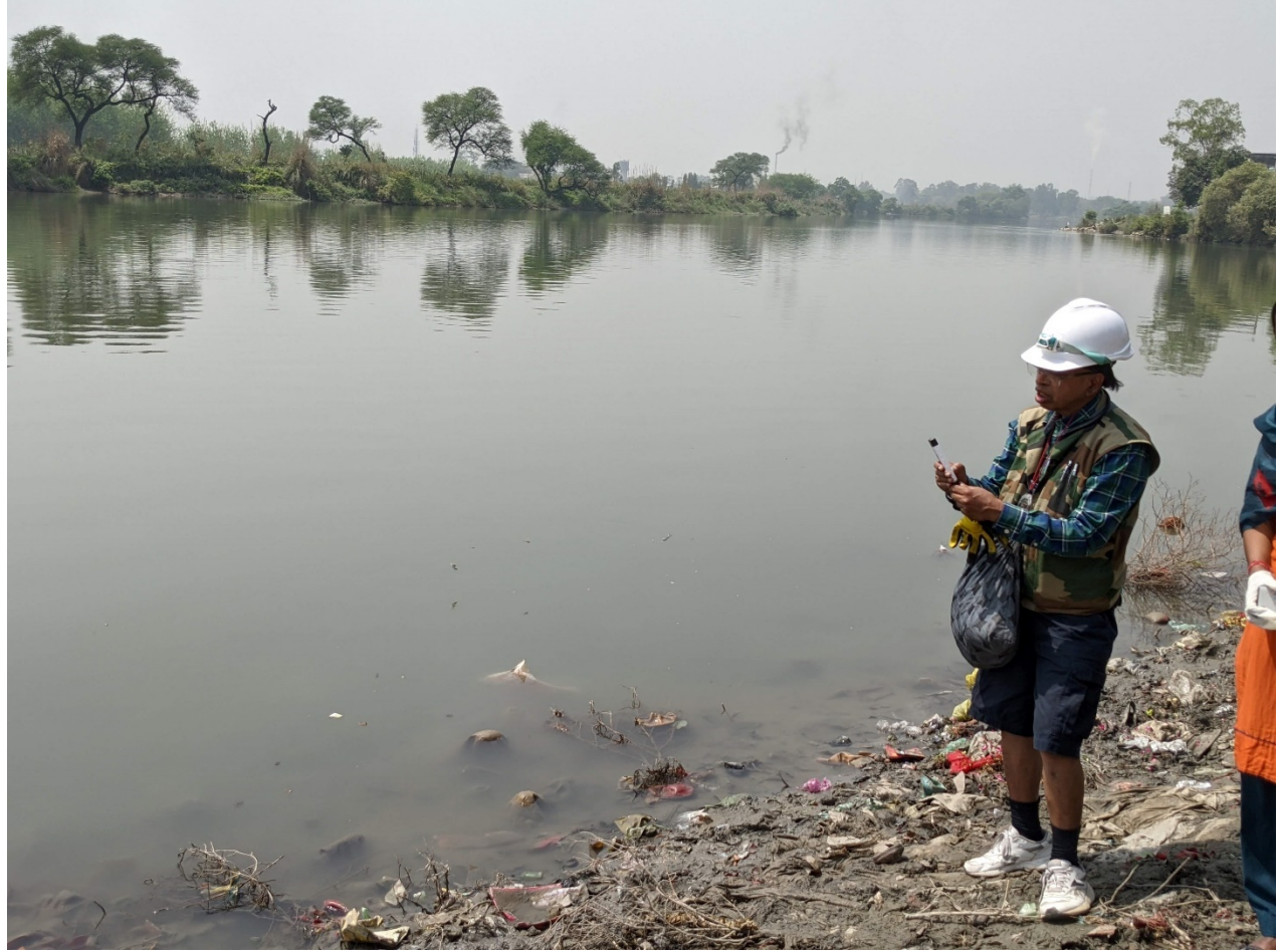
Yamuna Ghat, Yamuna Nagar water quality testing by the ROW team

The results indicate that the water is quite suitable for domestic use. Since we didn't check the bacterial content of the water, this water must be boiled to 100 °C for 2 minutes and cooled down before it could be used for drinking purposes. Mild chlorination will also add safety. The picture below shows the river.