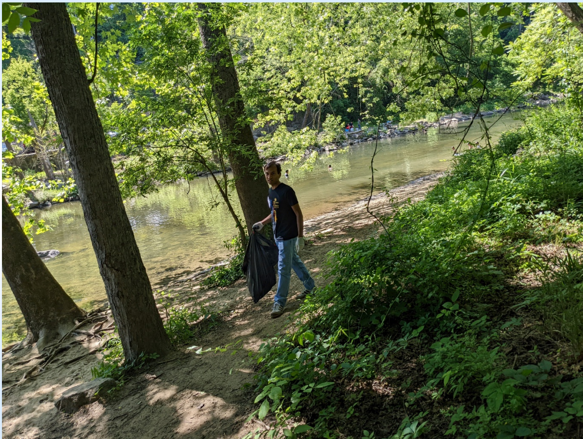
Row team picking up waste from the site