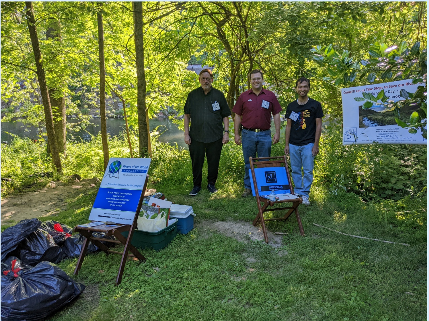
Waste bags collected from the area