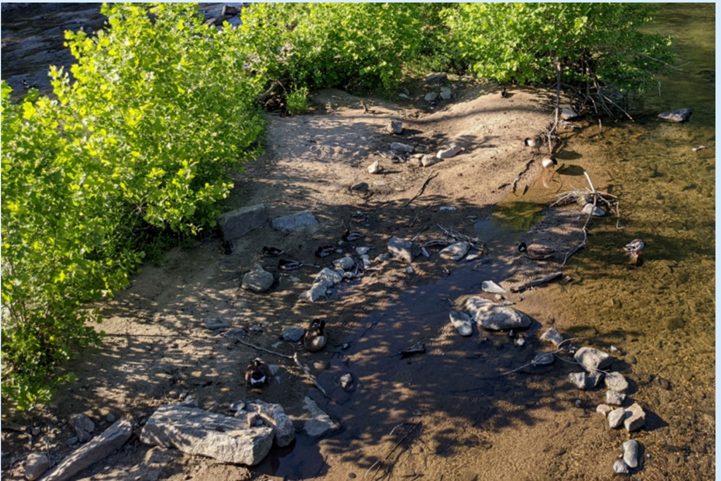
Nesting site for Canada Geese – Patapsco River