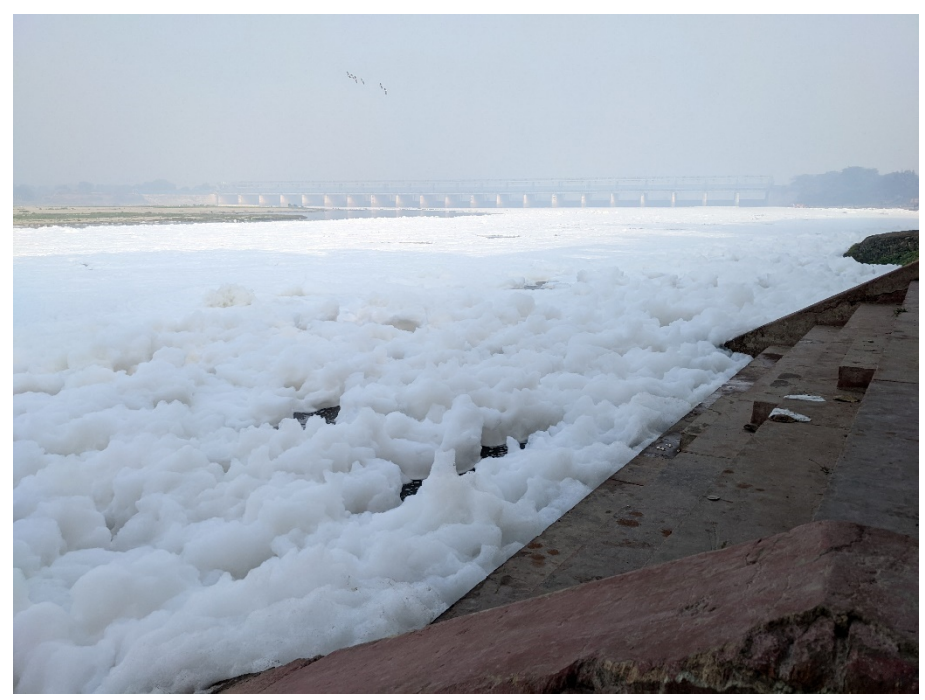
Yamuna River, Yashoda Ghat, Gokul

The cleanup and awareness activities were conducted on two days, March 27th, Sunday and March 28th, Monday.