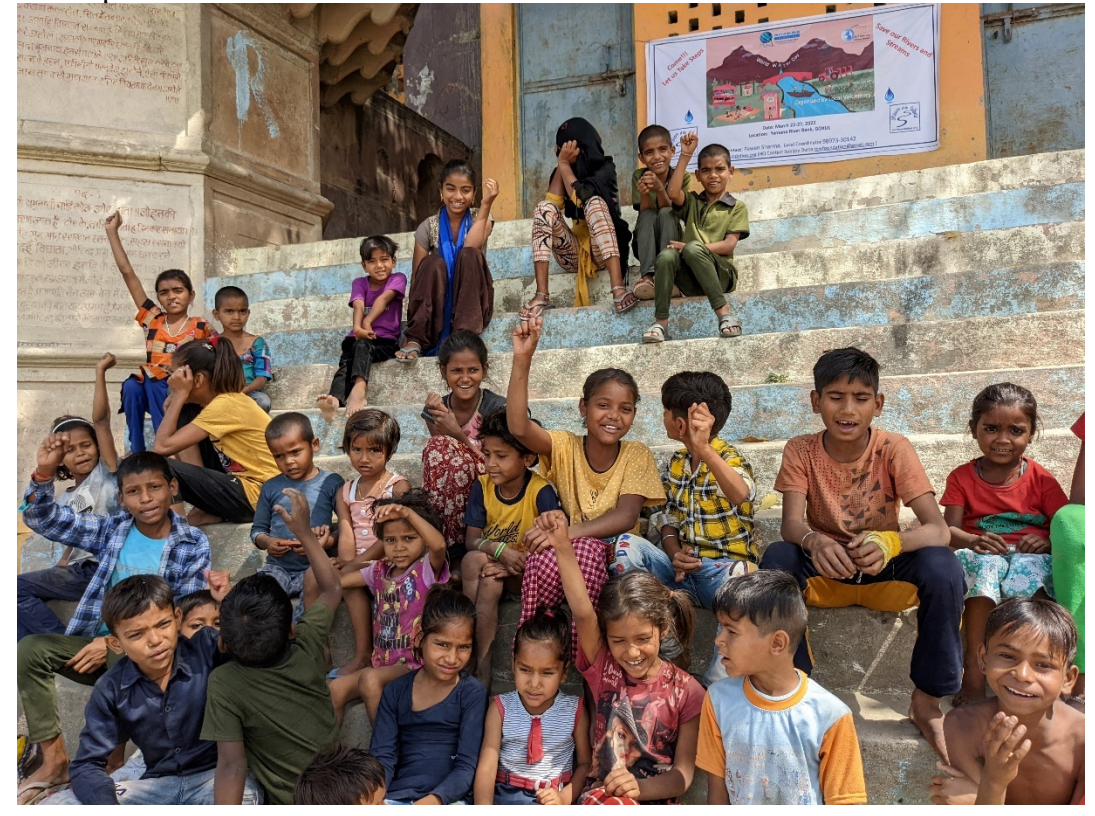
Page 2 of 8

program. A few pictures from the event below.