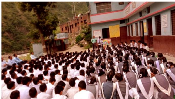
Student and Teacher of Himalayan English School Ghansali visited SVM School Ghansali and giving demonstration of water testing and monitoring.