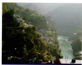
Headwaters of the Ganges