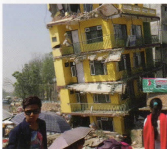
A Hotel in Nepal Struck by Earthquake