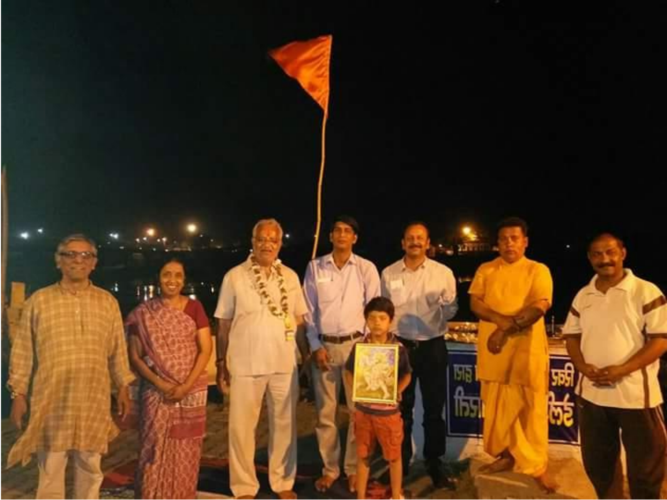
Picture below shows some of the participants for the WWD 2017 Yamuna 'Arti'