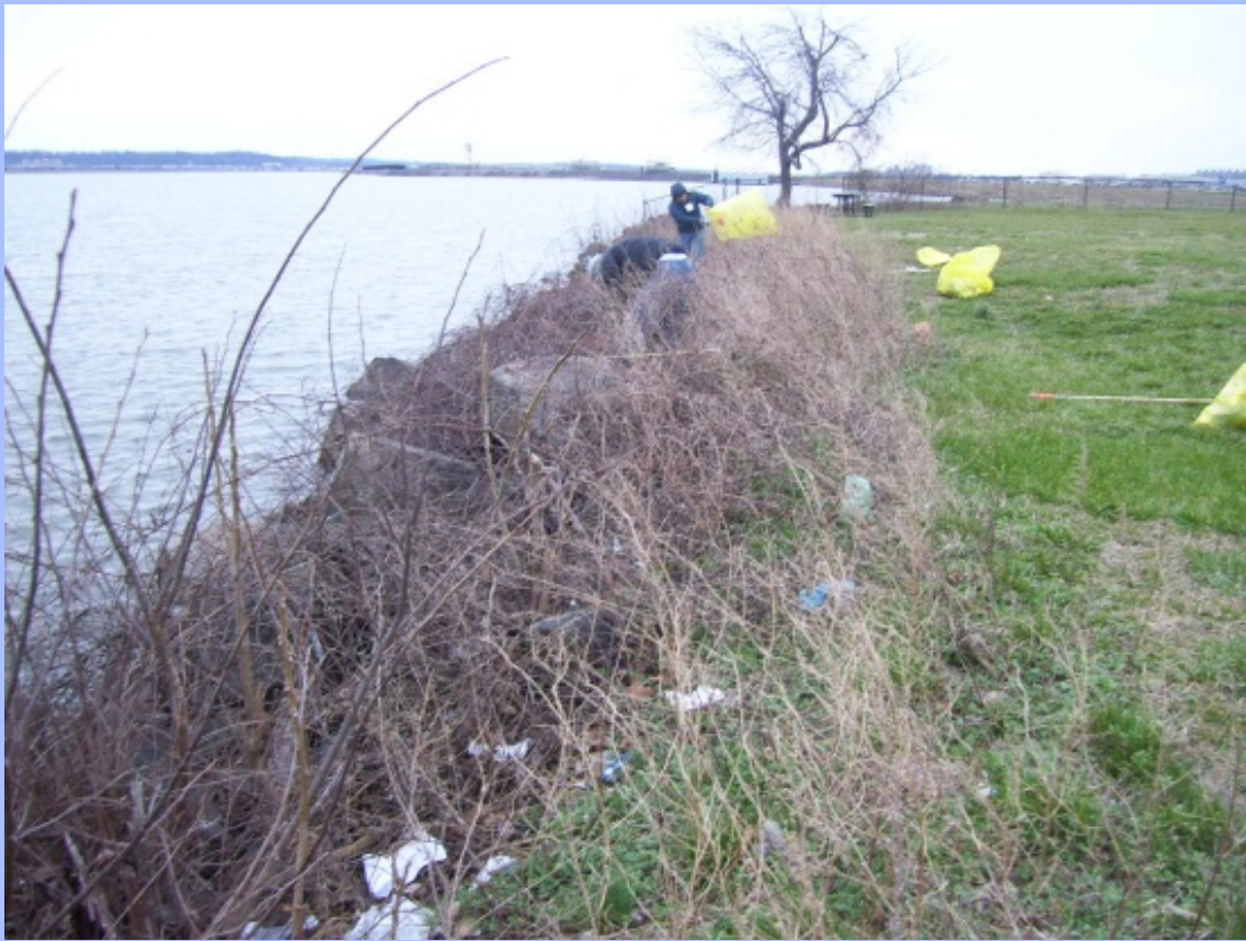
WWD2013 Washington, DC – Hidden Trash cleaned up from the Bank of Potomac River

After the cleanup was over, the local trash collection area provided by the Park service helped us to dispose the trash by using their garbage collection truck. A few pictures from the activity are provided below: