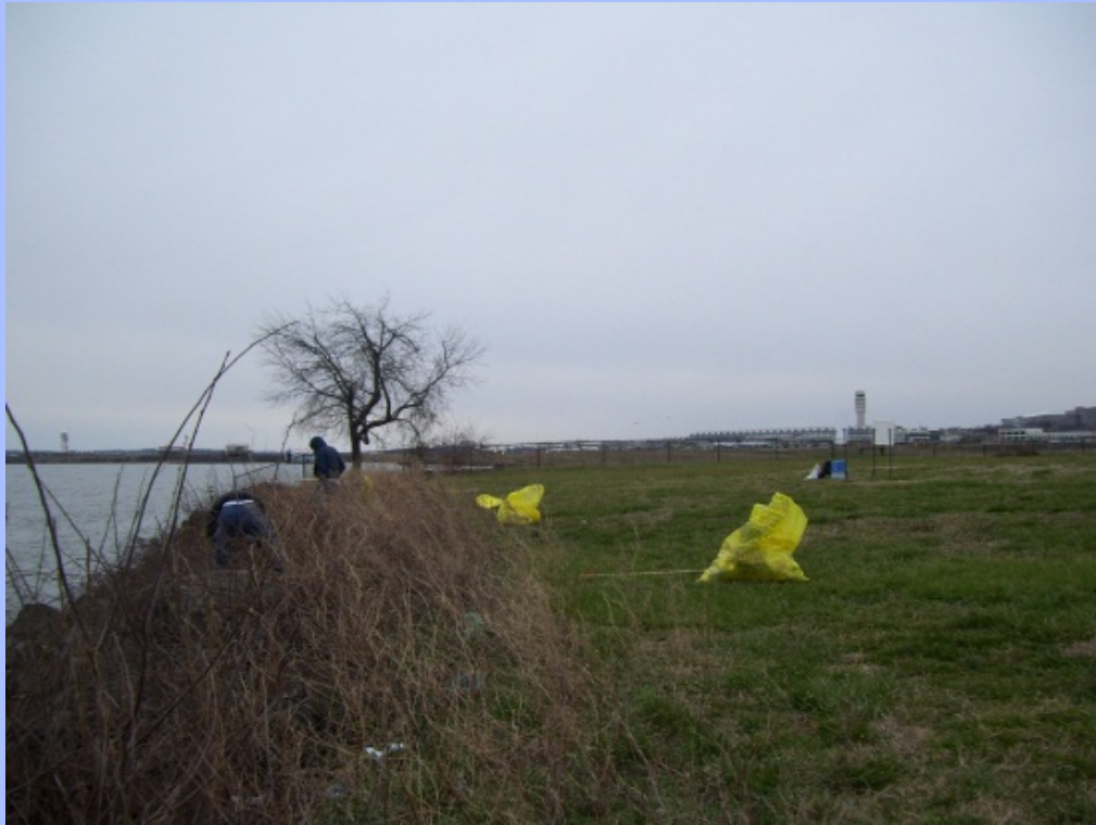
WWD013 Washington, DC - Trash cleanup of the Potomac River bank