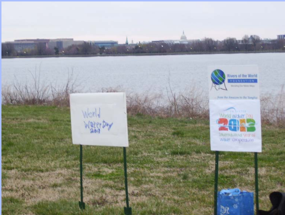
WWD2013 Washington, DC – Trash cleanup by the participants from the ROW Foundation.