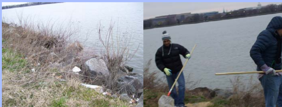
WWD2013 Washington, Dc – Trash cleanup from the Potomac River bank

After the cleanup was over, the local trash collection area provided by the Park service helped us to dispose the trash by using their garbage collection truck. A few pictures from the activity are provided below: