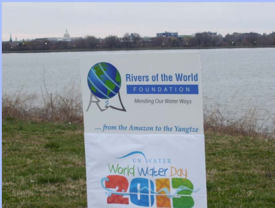
WWD2013 Washington, DC – Trash cleanup site Potomac River bank

The event was primarily coordinated by Subijoy Dutta and Dilli Neupane. In addition to the actual cleanup activity, some support works were performed by students not shown in the pictures.