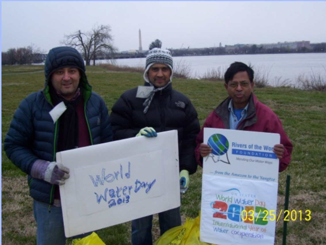
WWD2013 Washington, DC - Potomac River Trash cleanup. Washington Monument on the background