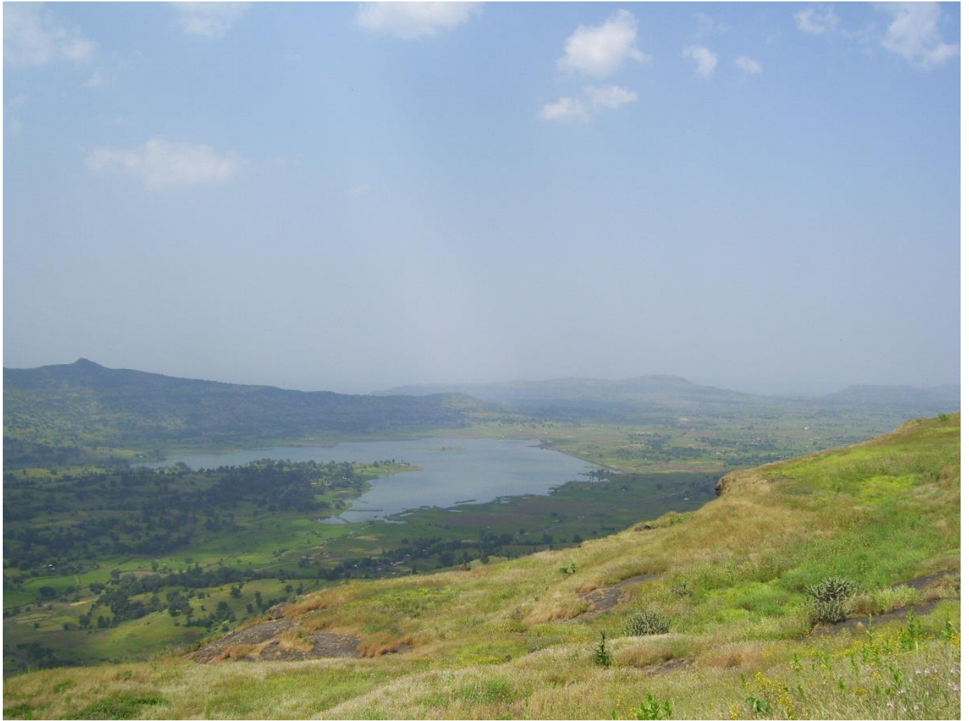
The Godavari River seen from the Brahmagiri peak (above).

While climbing up I noticed how the trail had a few local vendors selling water, fruits, and snacks. This practice resulted in plastics and other trash all around these small shops in the trail. This was shocking. I talked to the vendors and asked them to keep a small garbage bin in front of their shops where people could throw the trash coming out of the products they are selling. They seem to agree and said that they will arrange. That was then.