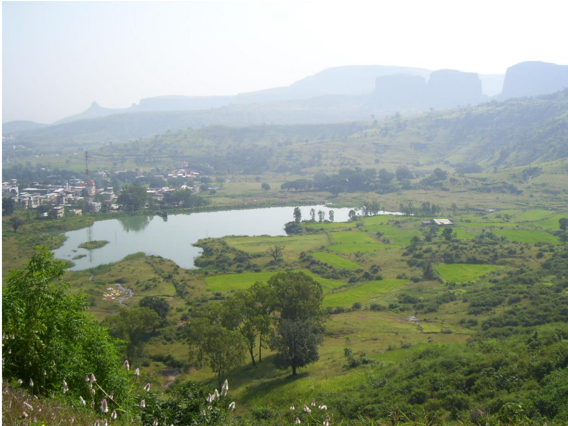
View of Trayambakeswar (above) while climbing to the Brahmagiri

I challenged a vendor and showed her how I could clean the frontage of her shop in 10 minutes, and then asked her if she could do that twice a day.