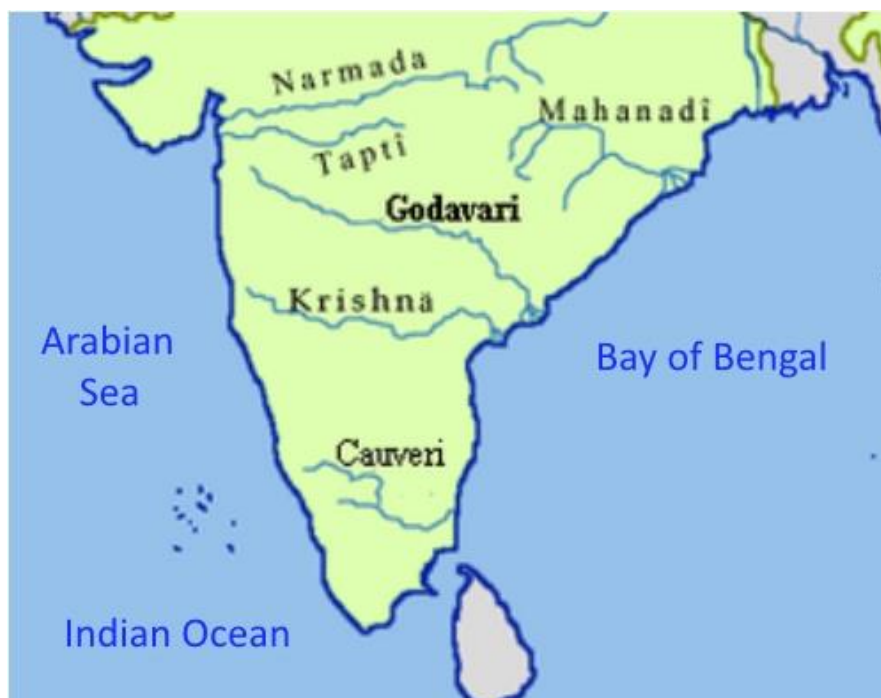
The path of Godavari River

These put together account for 24.2% of the total basin area. The rivers annual average water inflows are nearly 110 billion cubic metres. Nearly 50% of the water availability is being harnessed. The water allocation from the river among the riparian states are governed by the Godavari Water Disputes Tribunal. The river has highest flood flows in India and experienced recorded flood of 3.6 million cusecs in the year 1986 and annual flood of 1.0 million cusecs is normal.