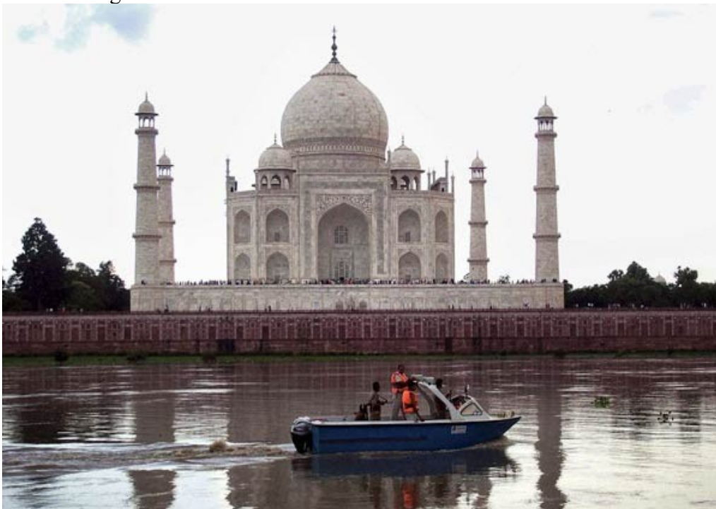
Yamuna River in Spate near Taj Mahal (Sep 2010)