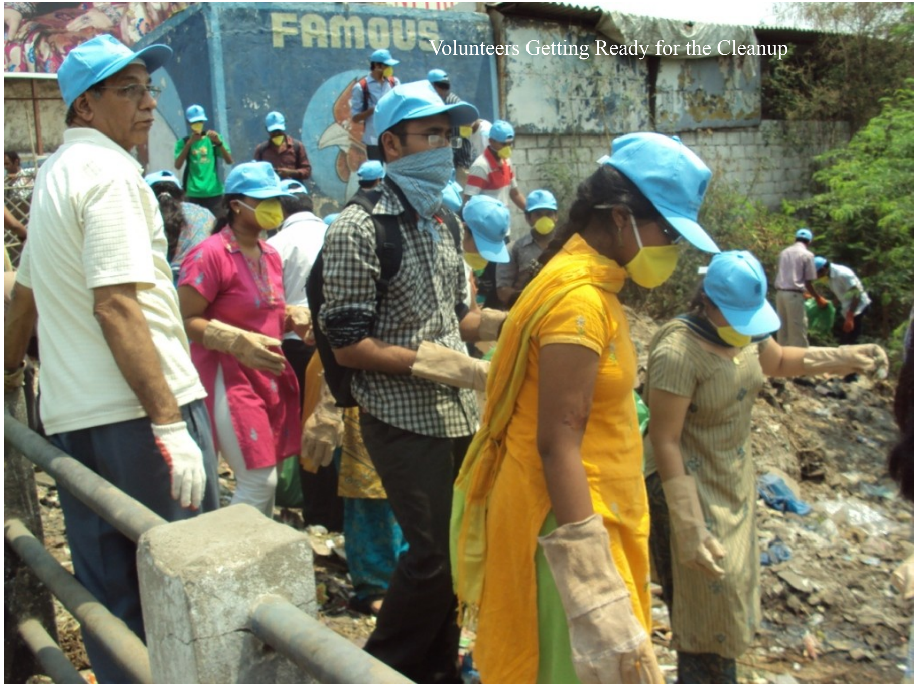
Volunteers Getting Ready for the Cleanup