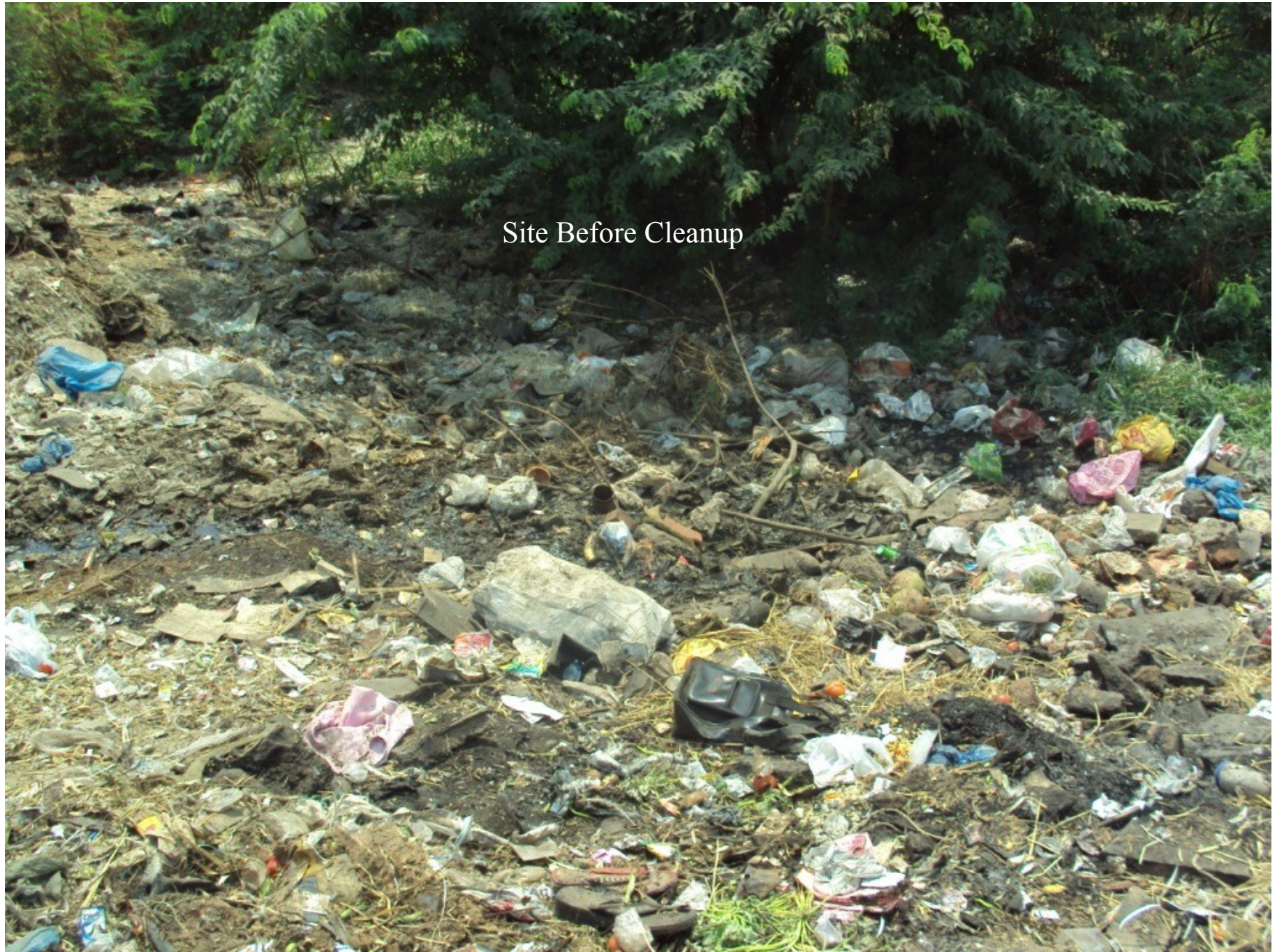
Site Before Cleanup