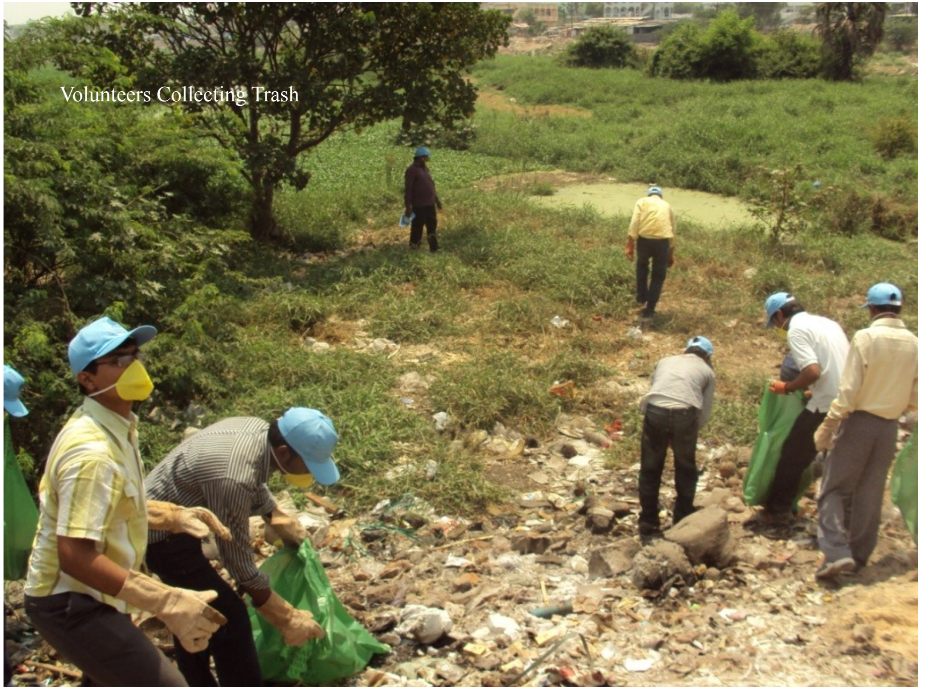
Volunteers Collecting Trash