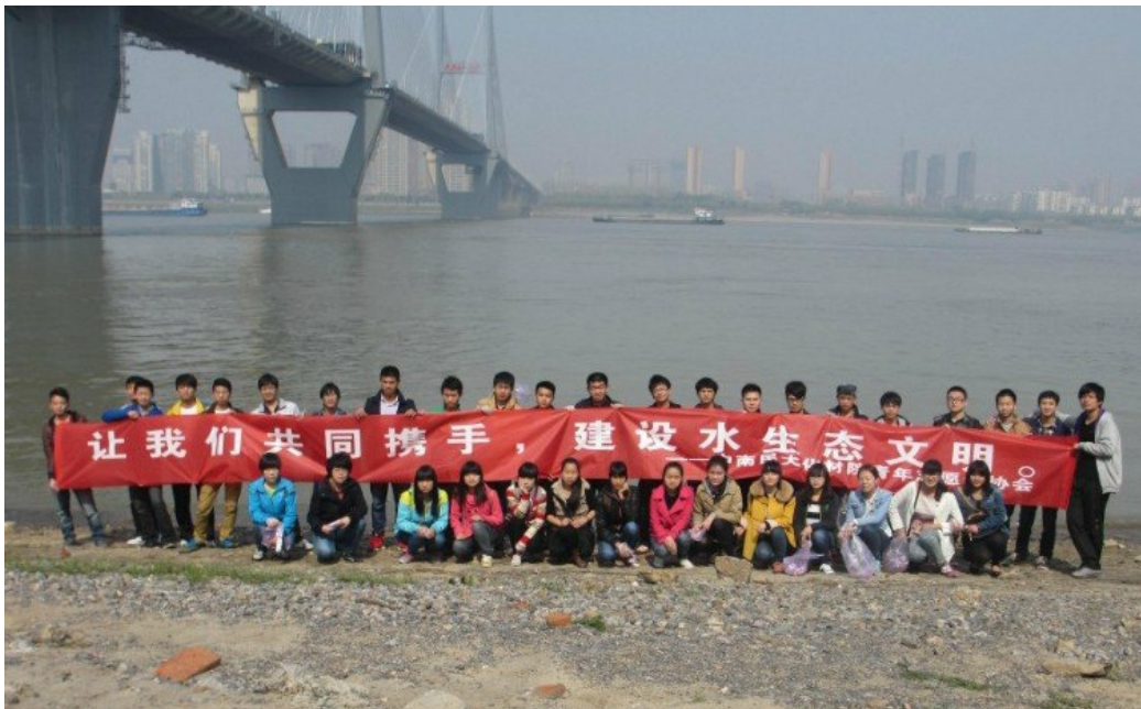
Young Volunteers Association of Chemistry and Materials Science, Central South University for Nationalities 中南民族大学化学与材料科学学院青年志愿者协会