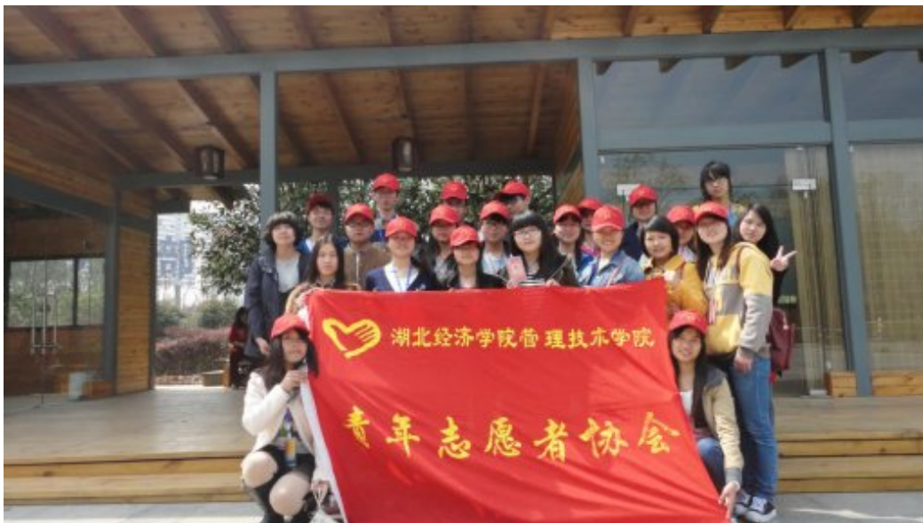
Hubei Institute for Economic Management Technical Academy Youth Volunteers Association 湖北经济学院管理技术学院青年志愿者协会