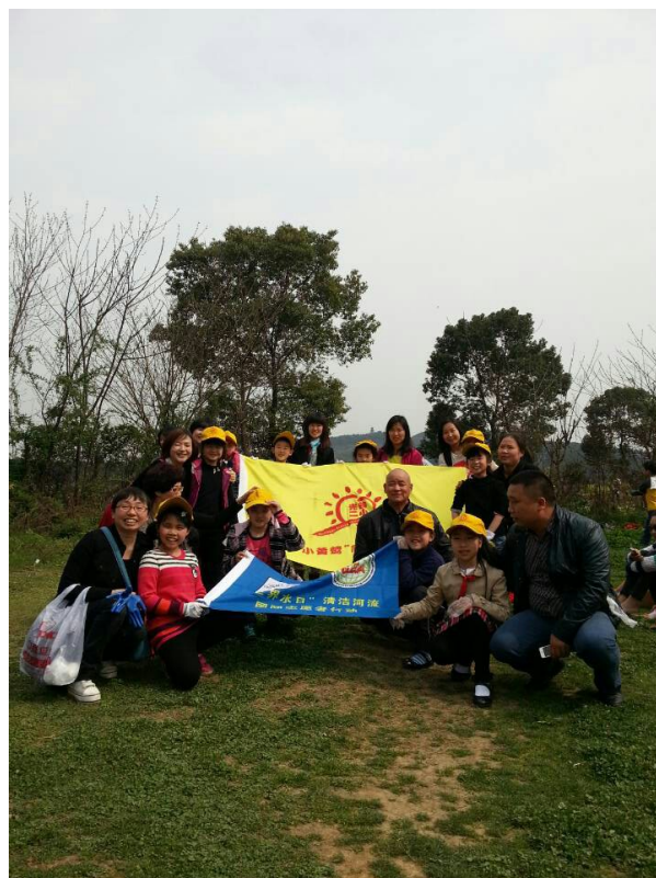
Second Primary Optical Valley "small oriole" Voluntary Services 光谷第二小学“小黄莺”志愿服务队