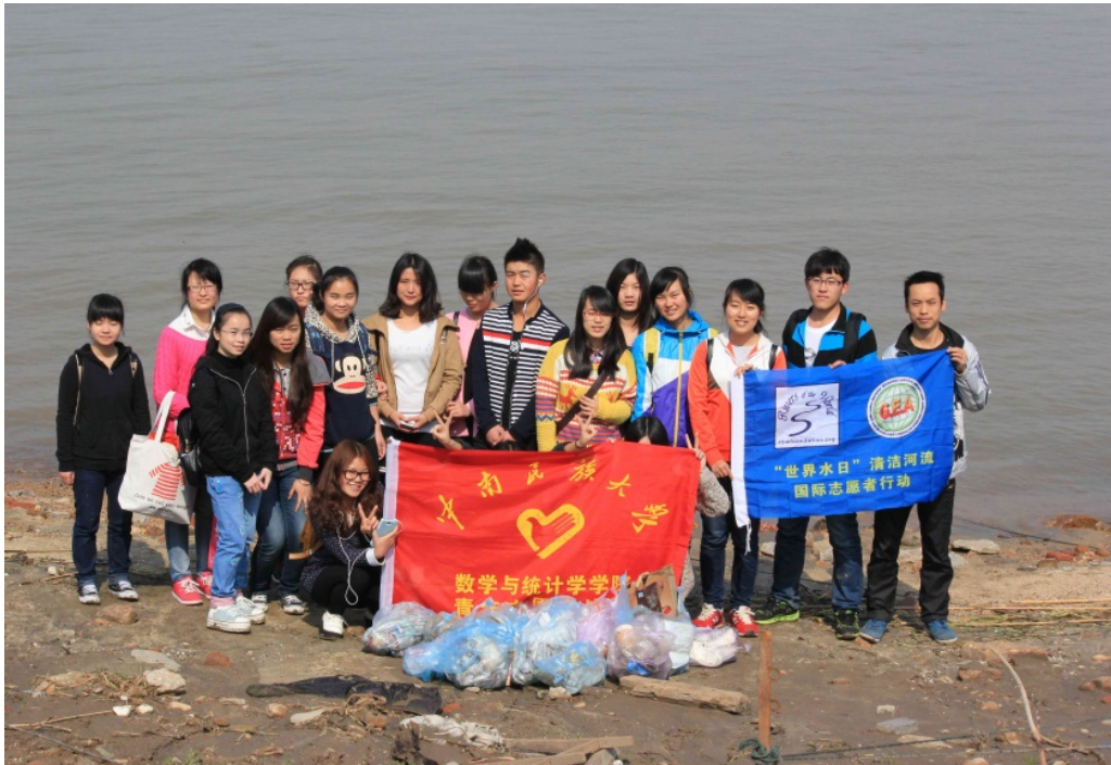
School of Mathematics and Statistics, Central University for Nationalities Youth Volunteers Association 中南民族大学数学与统计学学院青年志愿 者协会