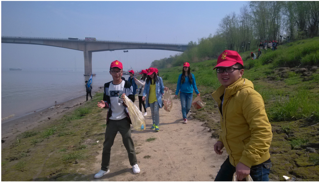
Wuhan Vocational School of Computing Zhixian Association 武汉职业计算学院志贤者协会