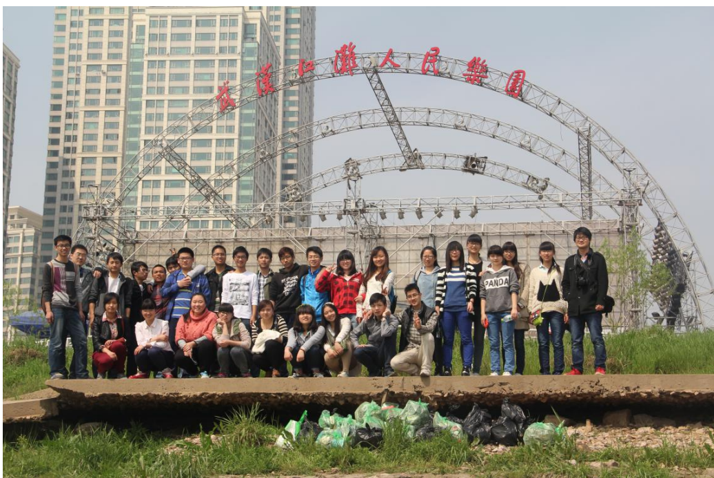
Fisheries Fisheries College, Huazhong Agricultural University, Ministry of Youth Volunteer Work 华中农业大学水产水产学院青年志愿者工作部