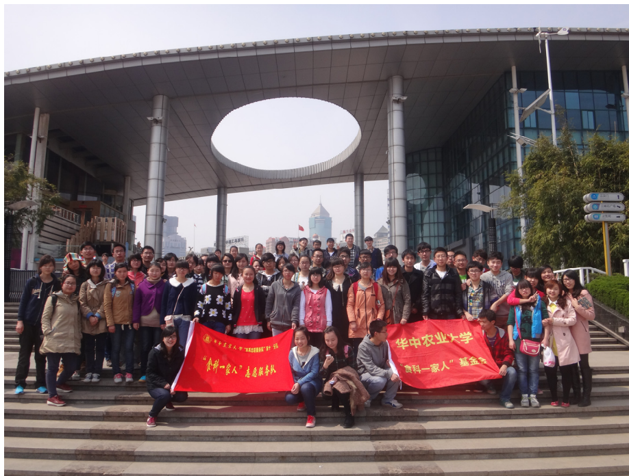
Huazhong Agricultural University "Food Branch family" Foundation – 华中农业大学“食科一家人”基金会